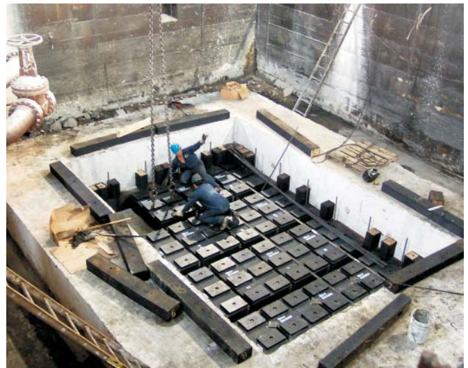
MRM Isolation Elements being placed into pit

The following additional precautions were taken to prevent the elements from shifting under any unanticipated operational conditions: