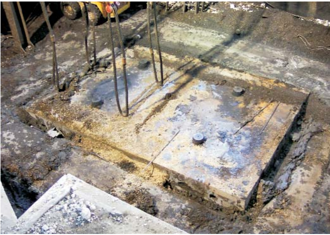
Tilted sub-plate with foundation mass oozing from underneath

The most recent system ( alternating layers of laminated fabric pad material and steel plates ) was installed on top of a mixture of concrete and grout poured into the original pit to compensate for a height difference between the timber/pad system and the new pad/plate system. The material extruded from beneath the hammer was examined and found to be a mixture of concrete, grout, pad material, and water.