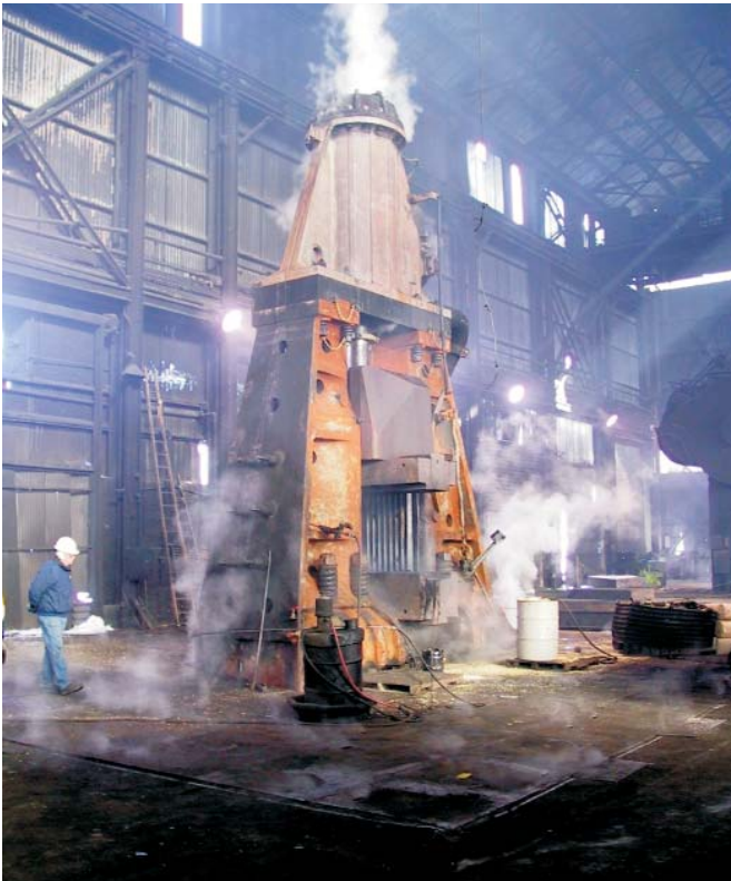
Installation of a 50,000 lb. Erie Steam Hammer Complete!

Vibro/Dynamics has manufactured and supplied custom engineered installation and isolation systems for a wide range of industrial machinery since 1965.