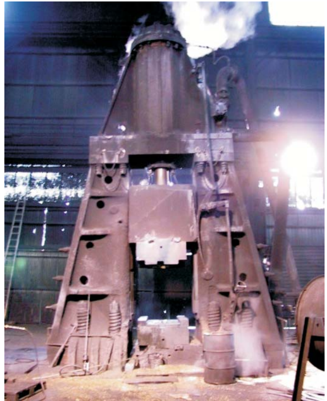
Hammer leaning to the left and front due to foundation failure

Kropp Forge originally installed (2) of these forging hammers in the early 1950's. The two hammers were installed side-by-side in pits with 42' x 36' x 23.5' deep foundations weighing more than 5.5 million pounds each. One of the hammers was later removed and replaced with a 40,000 lb. CECO steam hammer.