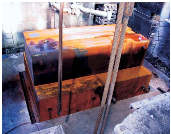
Stacking the Steam Hammer