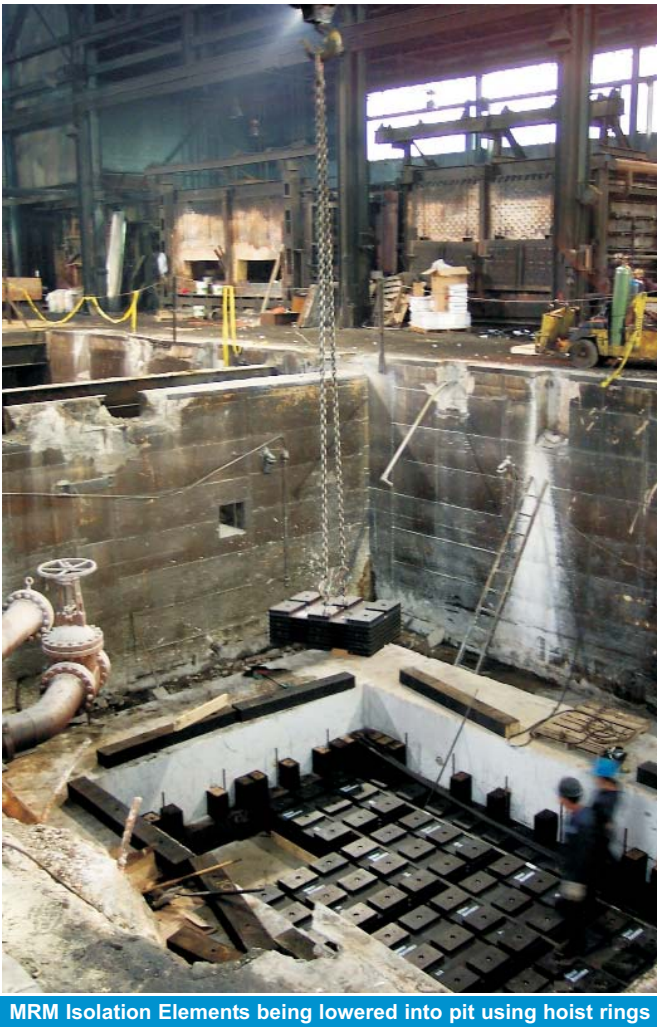
MRM Isolation Elements being lowered into pit using hoist rings

Hoist rings were attached to the lifting bolts on each Element, and then each Element was simply lowered into the pit and placed directly on the concrete foundation. Installation was quick and easy!