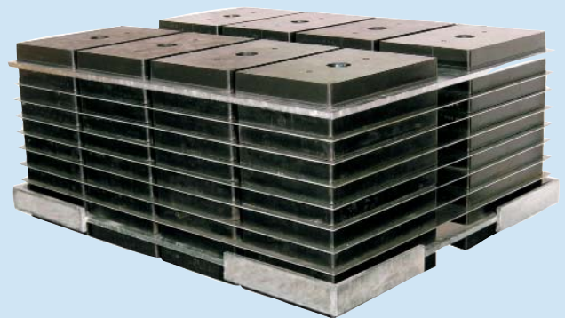
MRM Isolation Elements are Custom Engineered and Sized (MRM8x10-1-G with Galvanized Option shown)