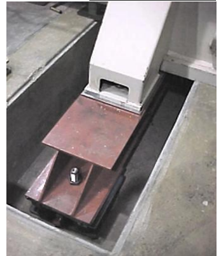
Close-up of an isolator and outrigger beam under a press foot.