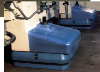
Installation of a high-speed press on VSML Isolators