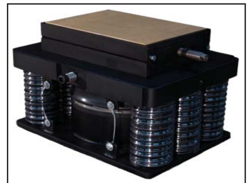
VSVL Series with Wedge Leveling Device