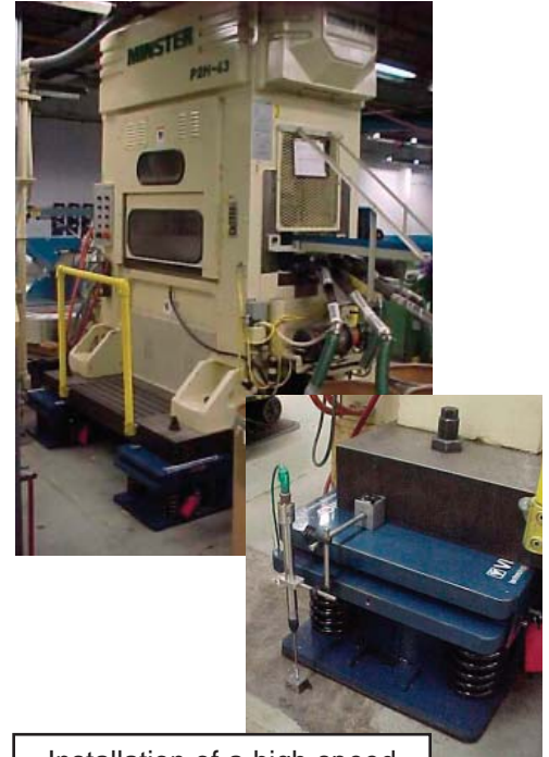
Installation of a high-speed press on VSVL2408 Isolators

A built-in leveling feature lets you get into production faster by leveling your machines quicker with far greater accuracy than the trial and error method offered by shims and grout.